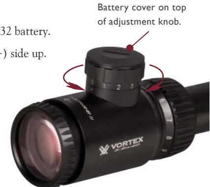
Battery cover on top of adjustment knob.