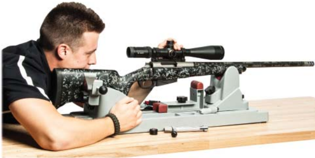
Visually bore-sighting a rifle.