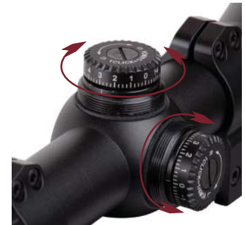
To adjust settings, turn dials: · Up / Down · Left / Right

Begin adjusting the windage and elevation settings by first removing the outer covers. Then, move the turrets in the direction you wish the bullet's point-of-impact to change. To make the adjustments, rotate the adjustment dial in the appropriate direction (up/down or left/right) as indicated by the arrows.