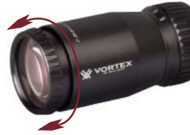
Adjust the reticle focus

Once this adjustment is complete, it will not be necessary to re-focus every time you use the rifle scope. However, because your eyesight may change over time, you should re-check this adjustment periodically.