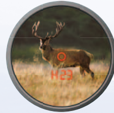
After the distance is displayed, H 23 appears. The hunter must aim 23 cm over the aiming point on the target.