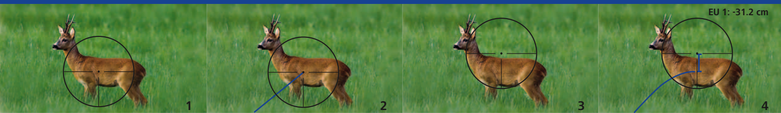
100 m sight-in distance: Target Point = Aiming Point (ill. 1). Trajectory 100 m (ill. 2).