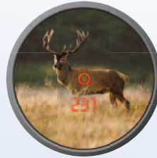
Display of 237 meters in the field of view.

The combination of quick operation and accurate performance is unique: by pressing the range-finder button once, a measurement of distances up to 1,200 meters can be made. After sighting the object with the reticle, measurement is completed when the button is released. The measured distance is placed directly into the field of view by a self-illuminating LED display. Scan Mode enables continuous measurements to be taken, helpful for gauging the distance of small and moving targets. When the range-finder button is pressed for more than 3 seconds, Scan Mode is activated automatically.